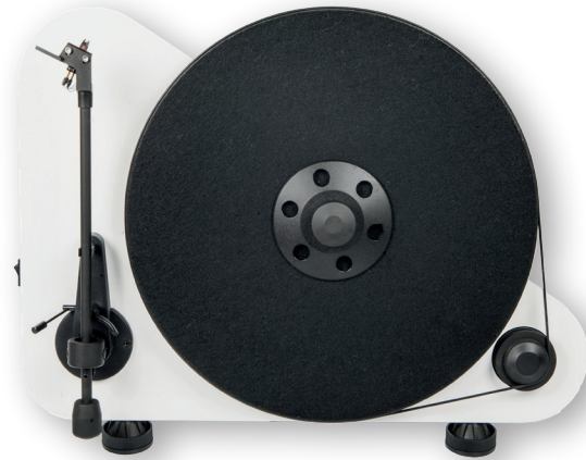
VT-E BT L (left handed)