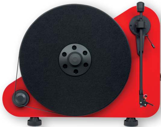
VT-E BT R (right handed)